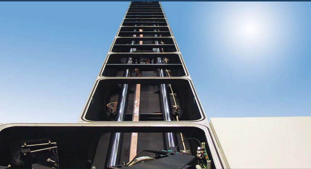
World's highest resolution commercial FT-IR at the ETH Zürich